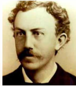
David Starr Jordan Stanford University President