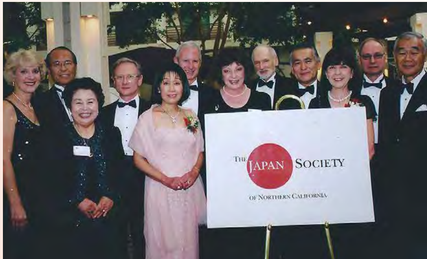
JSNC Centennial Celebration