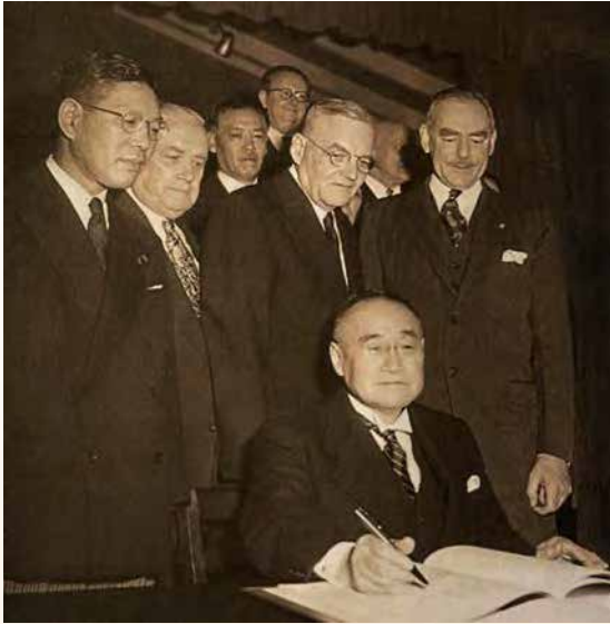
Prime Minister Yoshida Shigeru signs the bilateral security treaty with the United States on September 8, 1951. Secretary of State Dean Acheson (right) and special ambassador John Foster Dulles stand directly behind him. The Japanese official on the left is Ikeda Hayato, who served as prime minister from 1960 to 1964.

The Japan Society of Northern California commemorates the 70th Anniversary of the signing of the San Francisco Peace Treaty. We honor this historic event by hosting the 2021 gala at the actual site, the San Francisco War Memorial Opera House.